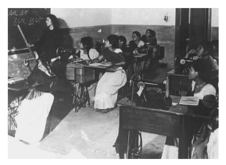
Figure 2. Revolutionary education for rural women.

The liberal laws did not produce many changes until society was shaken by the Mexican Revolution of 1910. It was then that the political system under the long-term government of President Porfirio Díaz entered into a profound crisis in which customs and social order were also revolutionised. Despite the transformations, a patriarchal vision prevailed in the representation of women: